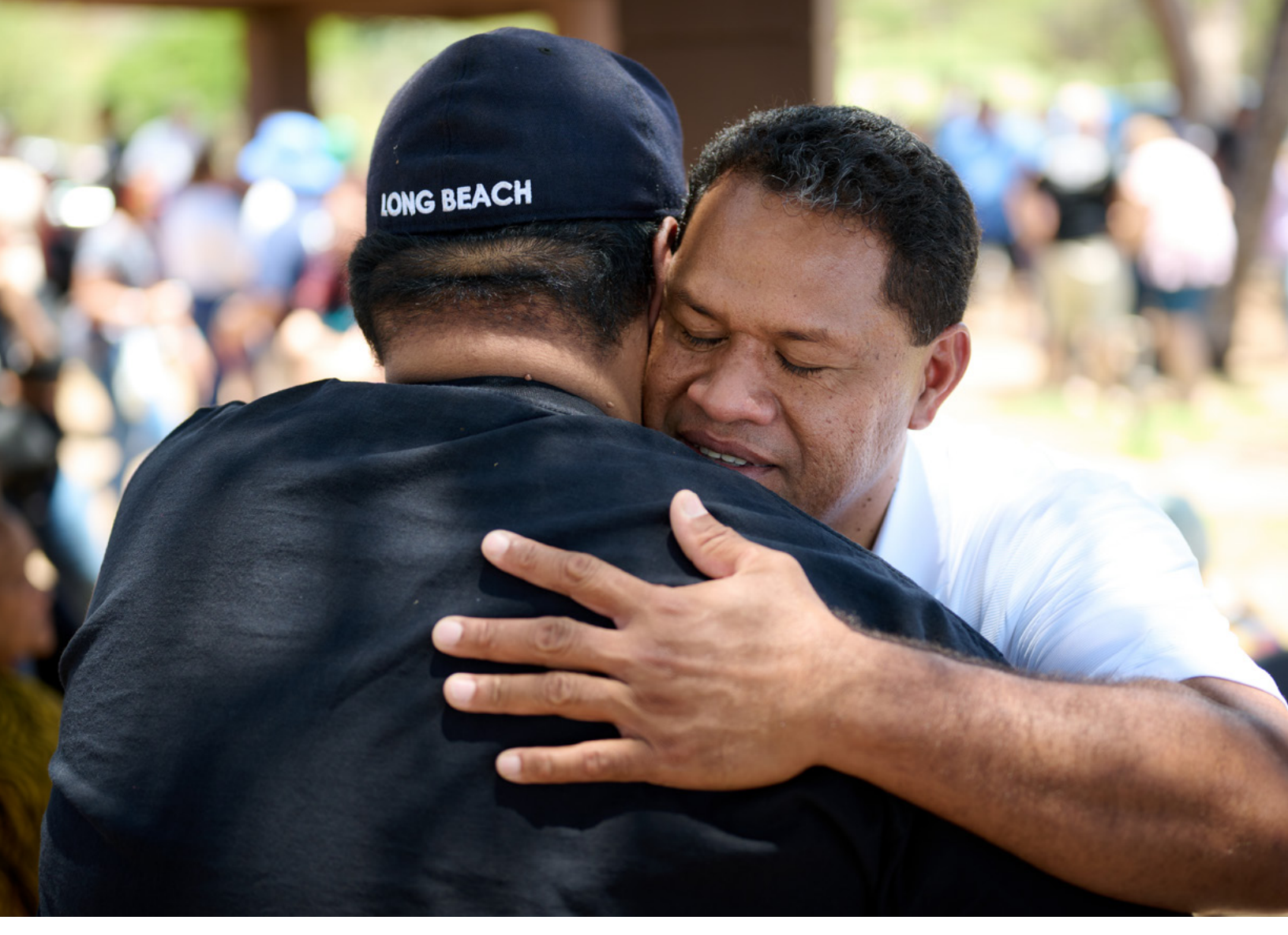
Two community members hug each other following the wildfires in Maui.