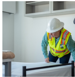
Left: A displaced family in Syria is given a shelter kit and other needed materials. Right: Local volunteers help prepare beds at a homeless shelter in California.