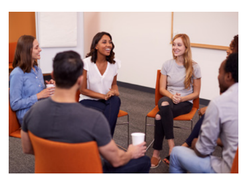
Left: A young woman smiles as she admires the view with her friends. Center: An addiction recovery group meeting. Right: Church members lead and participate in an emotional resilience course.