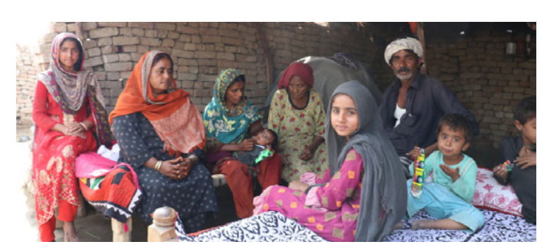
A family in Pakistan gathers in a shelter after flooding displaced them from their home.

Church humanitarian aid in Morocco is making a significant impact on segments of the population often overlooked by society. Among other efforts in 2023, the Church provided outdoor activity spaces and dormitories for the Passerelle Autistic Center. This center teaches youth with autism basic skills to help them become more self-sufficient, as well as specialized skills in farming, sports, music, and the arts. These efforts increase the employability of and enhance the quality of life for the center's young residents.