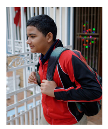
Left: An English Connect class gathers for an English lesson. Right: A young man on his way to school in Puerto Rico