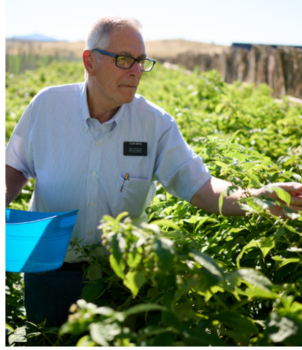
Left: A child in Haiti enjoys a nutritious school meal. Right: A senior missionary picks berries at a Church-owned farm.