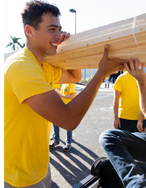
Left: A member of the Church in Maui carries supplies donated to help with wildfire relief. Right: Volunteers pick up supplies to assist with hurricane relief in Florida.