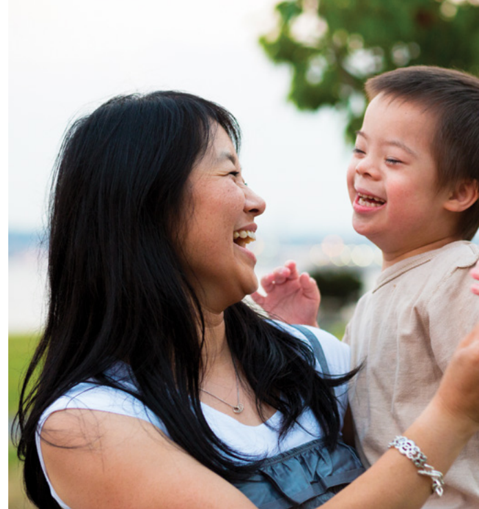
Mothers embracing their children.

921 humanitarian projects focused on women and children