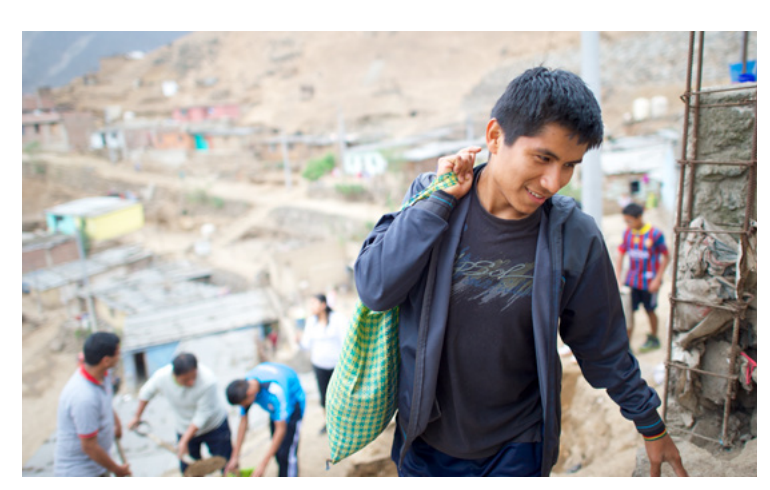
A young man participates in a service project in Peru.

In 2023, Church members in Central and South America participated in blood drives to support local hospitals and patients. The Church also provided equipment, training, and other support to medical facilities and healthcare initiatives throughout the region. In El Salvador, for example, the Church collaborated with the National Institute of Santa Ana to provide eyeglasses to hundreds of students.