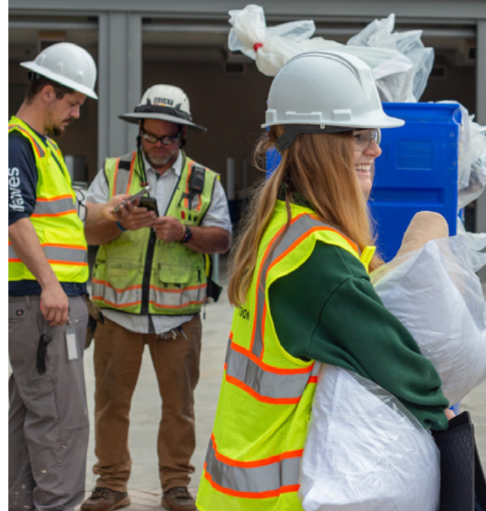
Left: Young men leaders load up wood to benefit individuals living on Native American Reservations in the United States. Right: Volunteers prepare a homeless shelter in California.

200 projects focused on aiding women and children