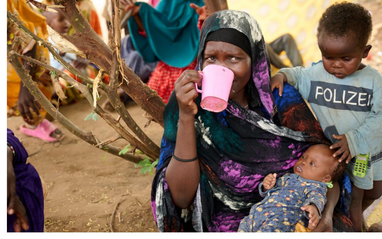
A mother and child receive nourishment at a refugee camp in Kenya.