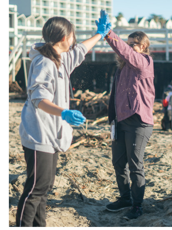
Left: A child in Yemen who has been displaced from his home sits on top of donated shelter materials. Right: Volunteers high five while clearing debris after a flood in California.