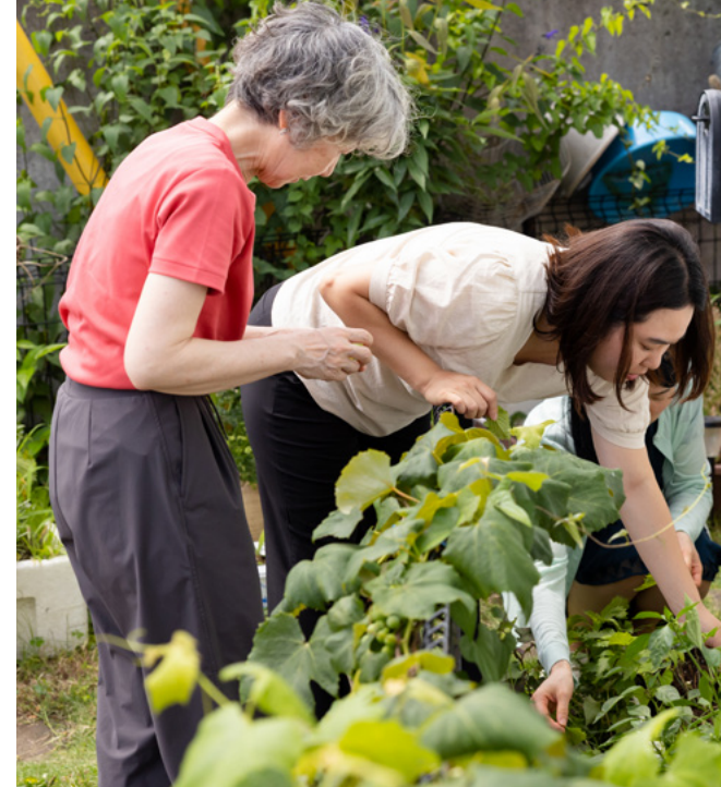
Left: Young women in Argentina serve by helping their neighbor buy groceries. Right: Women in Japan tend to a garden together.