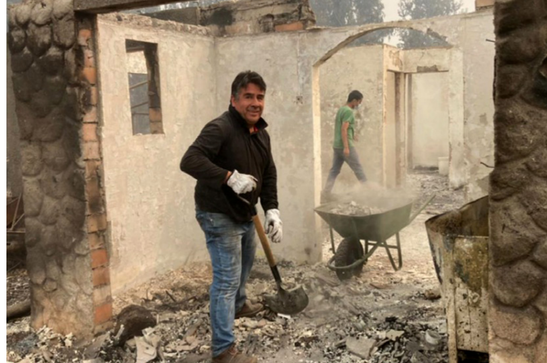
Left: Students in El Salvador receive eyeglasses. Right: A man helps clean up after a wildfire in Chile.

The Church also worked to refurbish classrooms and provide donated equipment to assist in students' learning. In Panama, for instance, the Church donated hundreds of computers to the Ministry of Education, helping hundreds of students receive greater access to online learning opportunities.