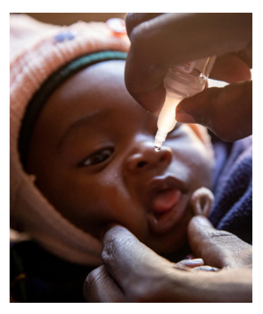
A healthcare worker administers a polio immunization for a baby in Zambia.

This donation was just one of several made by the Church in 2023, impacting thousands of individuals around the globe.