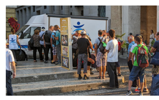
Left: A group of refugees from Ukraine receive emotional support from counselors. Right: Individuals experiencing homelessness in Rome wait in line to receive food and clothing.