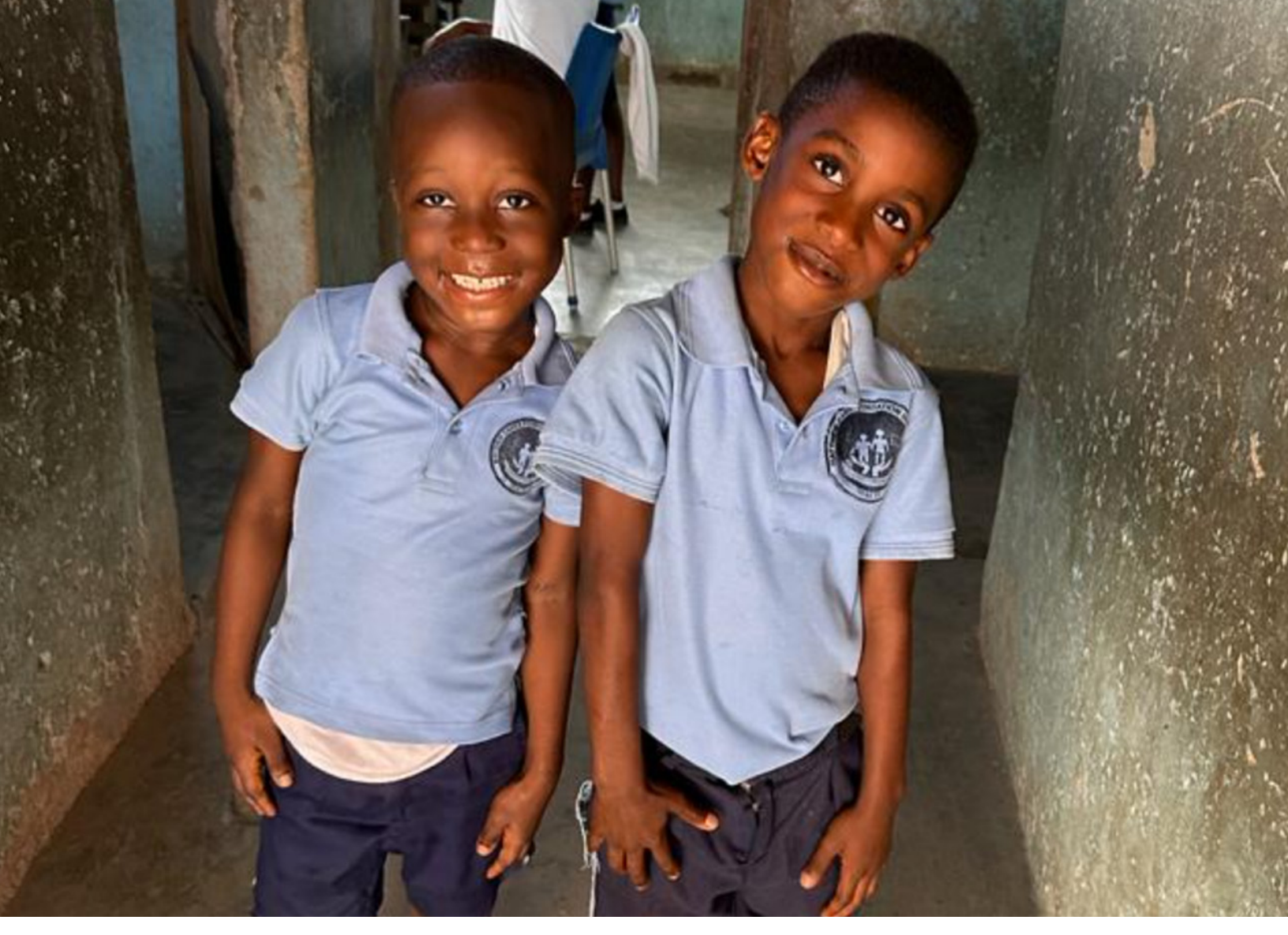
Children\ receive\ education\ inside\ a\ Liberian\ refugee\ camp\ in\ Ghana.\