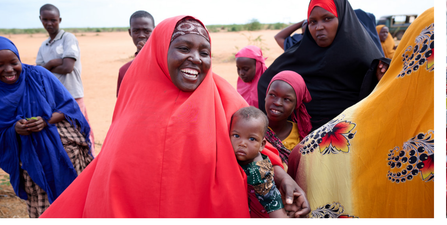
Individuals at the Ifo Refugee Camp in Kenya received aid through a joint project with the World Food Programme and The Church of Jesus Christ of Latter-day Saints.

"I salute the people who in small, personal ways go and find those people on the margins—those who hurt, those whose pains are not understood, the hungry, the lonely, the downtrodden—and do their best to take care of them."