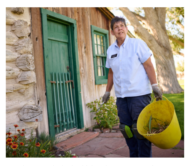
Top: Sister missionaries in France help a woman pack and carry boxes. Left: A service missionary provides service at the Church's Global Distribution Center. Top right: Senior sister missionaries lead a 12-step program with female prisoners. Bottom right: A senior missionary serves by helping with the landscaping outside a historic Church site in Utah.