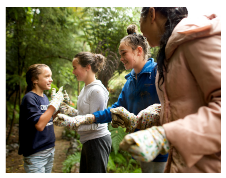
Young women participate in a service project in Australia.

Persistent drought and rising sea levels have led to a water crisis in the island nation of Kiribati. The salt content of the water sources on the outer islands have made them increasingly unsafe to drink. In response, the Church is working with CDE Suez Pacific to design and install water desalination units in five outer-island communities that will provide 5,000 residents with safe drinking water for years to come.