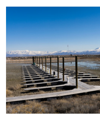
Left: A mother and her children ride bicycles together in Japan. Center: A young Church service missionary plants flowers around the Ogden Temple. Right: Docks sit on dry ground at the Great Salt Lake.