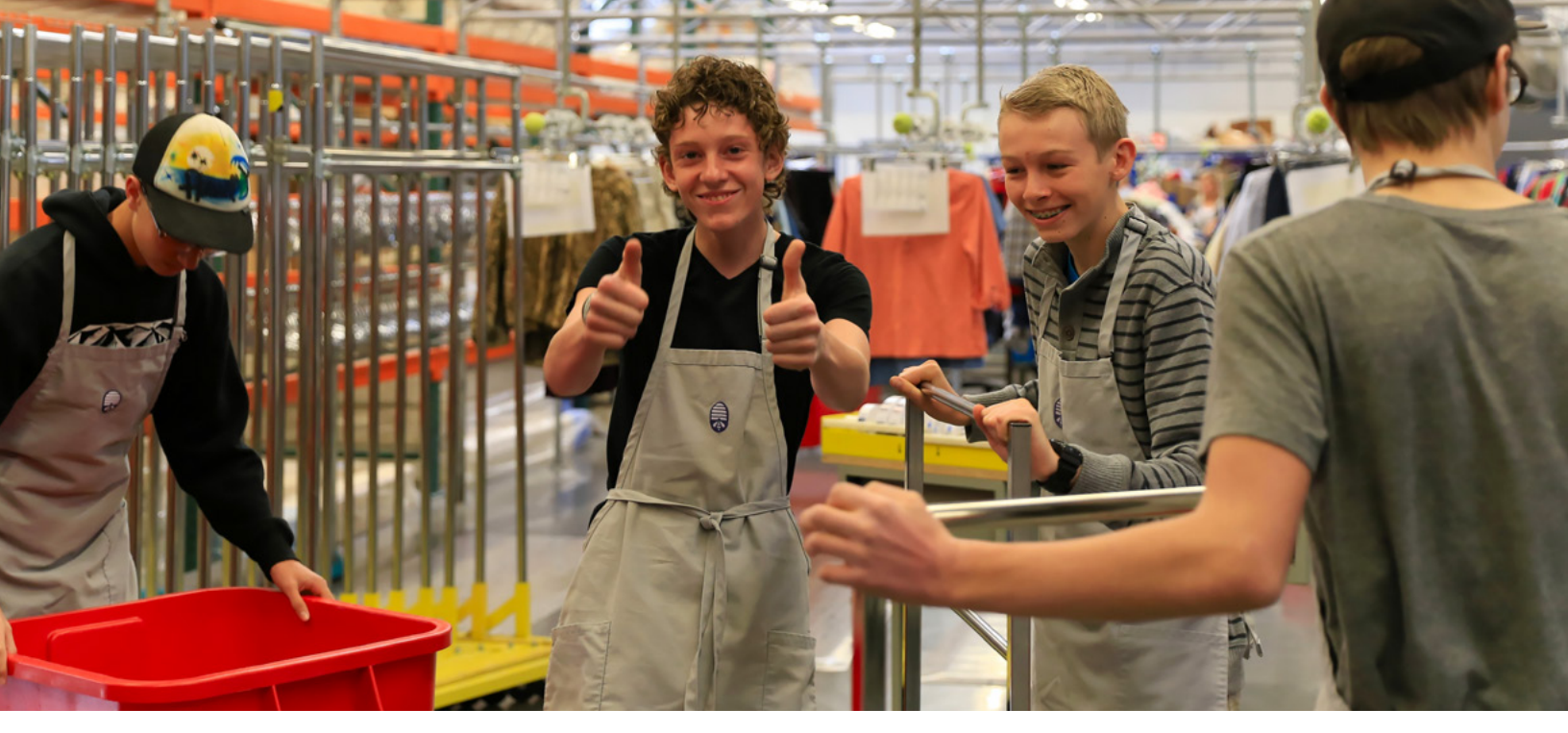
Young men volunteer their time, sorting donations at their local Deseret Industries store.