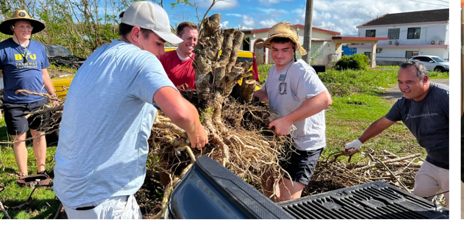
Members of the Church in Guam clean up the community after Typhoon Mawar.

Members of The Church of Jesus Christ of Latter-day Saints believe in following the Savior's two great commandments: to love God and to love our neighbor. Members show their love through ministering.