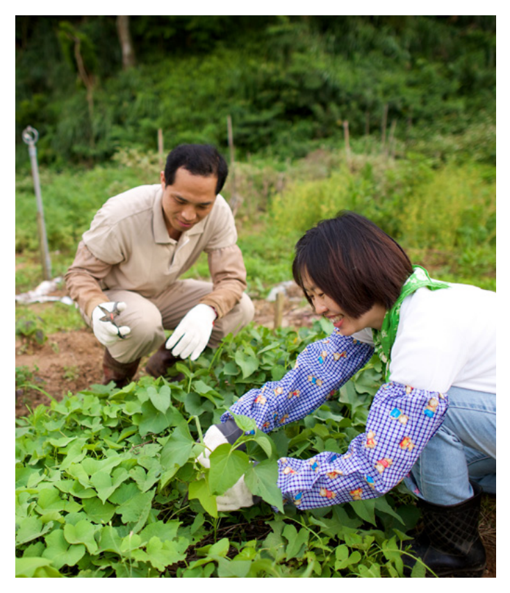
A couple works on their garden in Taiwan.