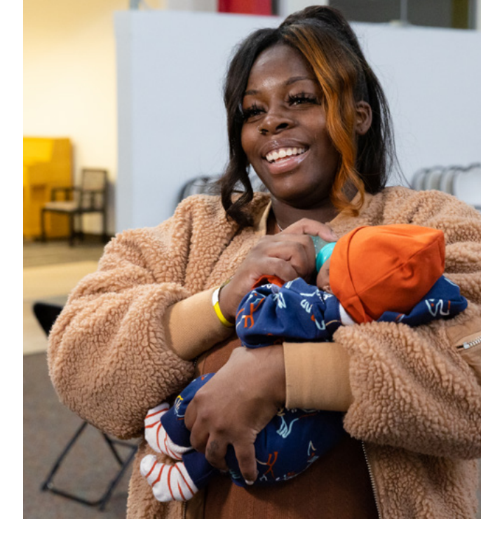
Left: Volunteers serve dinner at the Old Brewery Mission in Quebec. Right: A woman and her baby at The Chicago Citywide Community Baby Shower.

In the United States, the Church donated funds to Feeding America to help purchase food items for those in need. The Church also donated hundreds of truckloads of commodities to key food bank networks across the country.