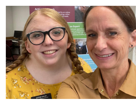
Left: Job seekers gather at an employment center to attend an Active Job Search group meeting. Center: A man in Mexico works in a restaurant. Right: A young service missionary and senior missionary, called to serve with Employment Services.