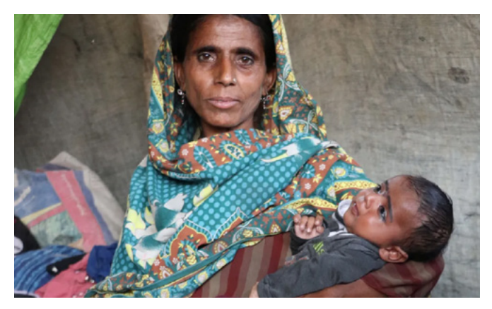
A mother and child reside in a temporary shelter after a flood destroyed their home and belongings in Pakistan.

In May, thousands of people in Malawi were displaced when the area was impacted by a 36-day tropical cyclone (the longest in recorded history). In addition to providing tents, blankets, and support to mobile clinics, the Church also sheltered hundreds of community members who had lost their homes. Church members shared food with these individuals, arranged travel to help some be with family members, and cared for others until they could find suitable housing.