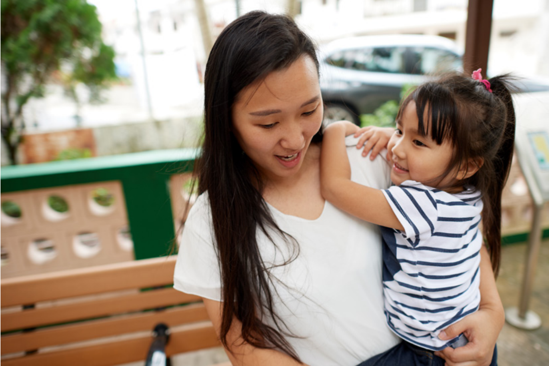
A mother and her daughter at a park in Hong Kong.